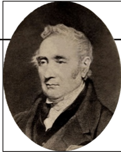
June 9, 1781 – August 12, 1848