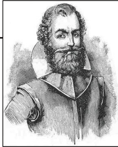
January 1580 - 21 June 1631