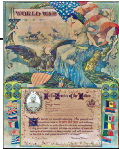
July 28, 1914 – November 11, 1918