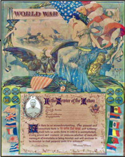
July 28, 1914 – November 11, 1918