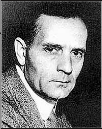
November 20, 1889 – September 28, 1953